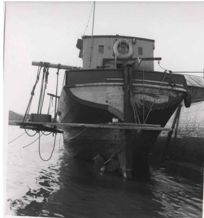
The new transom.